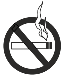
Do Not Smoke